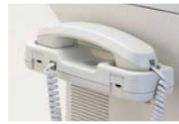
Handset Kit UE-403171

Memory SD Memory Card (Maximum 512MB) *Contact your local dealer